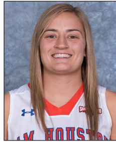
5 MORGHEN DAY 5-6 • Sr. • G Rockwall, Texas